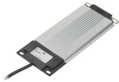
50W Flat Heater 061000-00