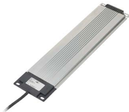
100W Flat Heater 061010-00