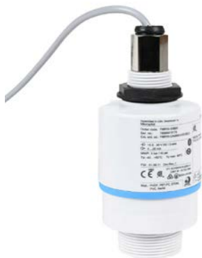
Part No. FMR10-CAQBMVCEE2

The Endress+Hauser Micropilot FMR10 pulsed radar liquid level sensor provides reliable, continuous, non-contact level measurement for liquids in storage tanks, open basins, pump lift stations, cooling towers, and canal systems. The Micropilot FMR10 can be configured to provide a 4-20mA analog output for liquid levels up to 8 meters (26.25 ft) or 12 meters (39.37 ft) when the flooding protection tube accessory is installed. Configuration and operation of the Micropilot FMR10 is accomplished using its Bluetooth wireless technology interface and the Endress+Hauser SmartBlue mobile app which, includes a linearization function that allows the conversion of the measured value into any unit of length, weight, flow, or volume. Envelope curves of the process can also be displayed and recorded using SmartBlue. The Micropilot FMR10 PVDF sensor body