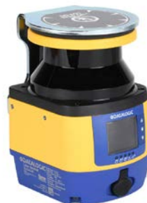
SLS-BRACKET-C assembled with SLS-SA5-08