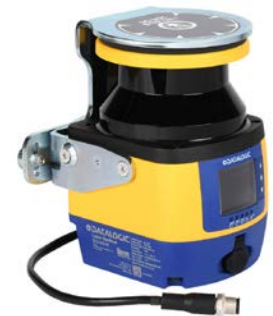
SLS-BRACKET-A and SLS-BRACKET-C assembled with SLS-SA5-08

EXAMPLE OF AN ASSEMBLED UNIT WITH TWO BRACKETS INSTALLED