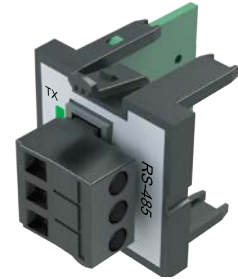
Removable Connector Included