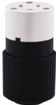
Straight Blade Connector.