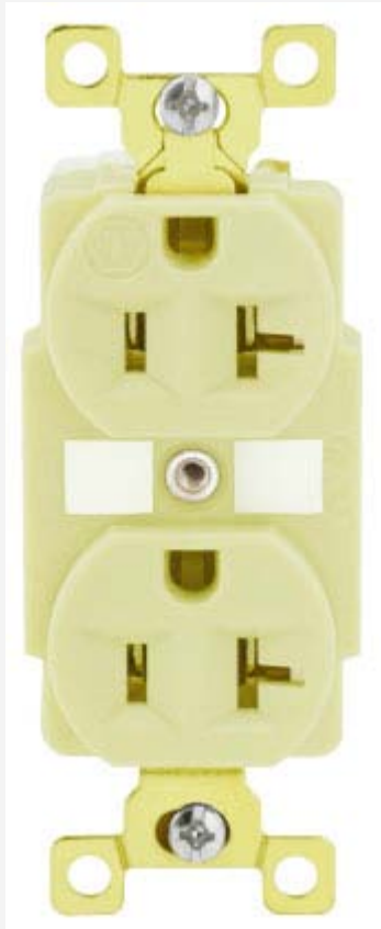
Straight Blade Duplex Receptacle.