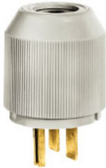
Straight Blade Plug.