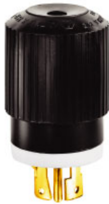
Locking Male Plug.