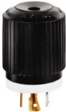
Locking Male Plug.