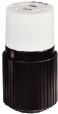
Locking Male Plug.