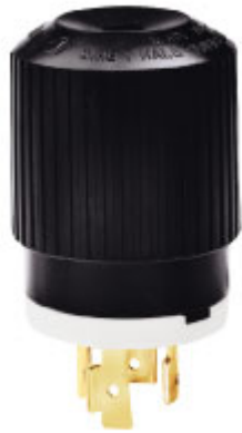
Locking Male Plug.