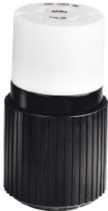
Locking Female Connector Body.