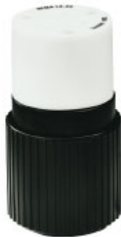
Locking Female Connector Body.