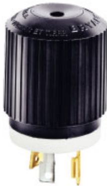
Locking Male Plug.