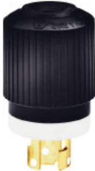
Locking Male Plug.