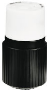
Locking Female Connector Body.