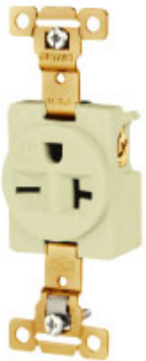
Straight Blade Single Flush Receptacle.