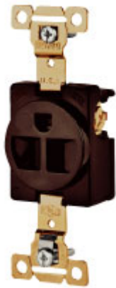
Straight Blade Single Flush Receptacle.