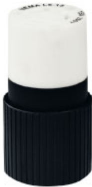
Locking Female Connector Body.