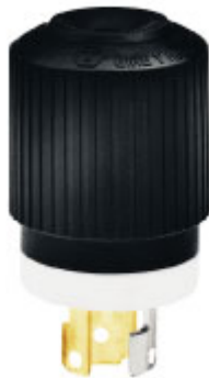
Locking Male Plug.