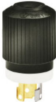
Locking Male Plug.