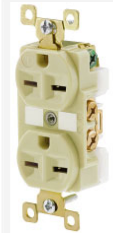
Straight Blade Duplex Receptacle.