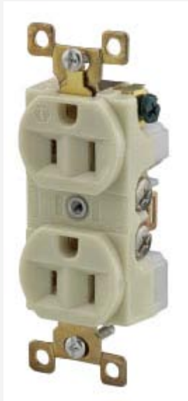
Straight Blade Duplex Receptacle.