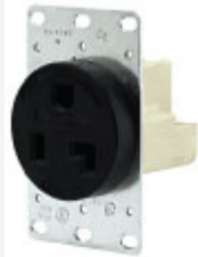
Straight Blade Single Flush Receptacle.