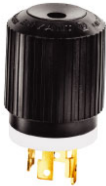
Locking Male Plug.