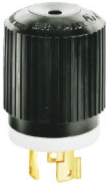
Locking Male Plug.