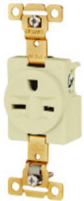
Straight Blade Single Flush Receptacle.