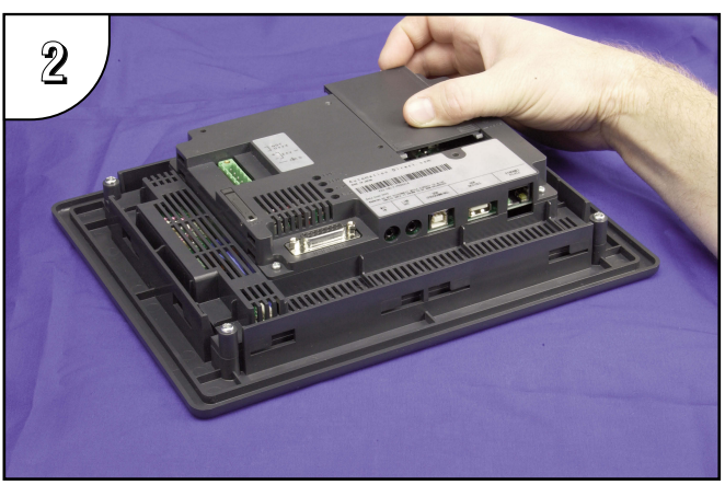
Remove expansion area cover by pressing down on the left and right line markings and at the same time, slide the cover in the direction of the embossed arrow.