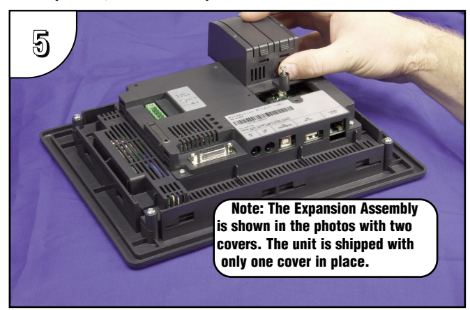
Slide the expansion assembly in a downward direction until the tic marks at the home position line up.