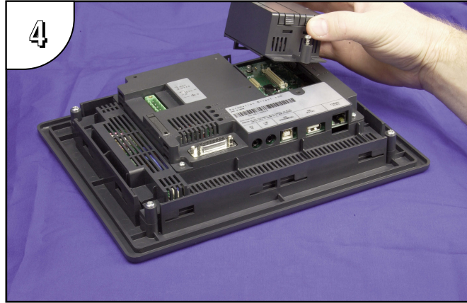
Position the expansion assembly over the opening so that the tic mark to the right of the fastening screw lines up with the "Remove" tic mark.