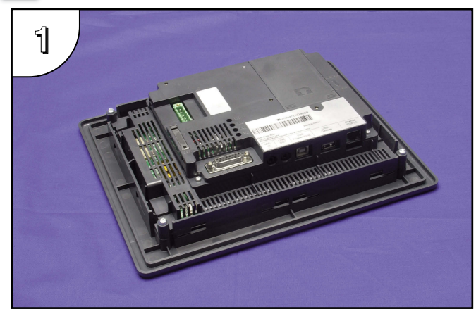
<u>Preparation:</u> Place the touch panel face down on a lint-free soft surface to prevent scratching the display screen if not already installed in a control cabinet.

NOTE: EA-EXP-OPT IS COMPATIBLE WITH EA7 SERIES TOUCH PANELS ONLY. EA-EXP-OPT WILL NOT FIT EA9 SERIES PANELS