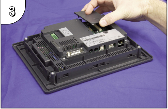
The cover will stop at the "Remove" position indicated by a tic mark on the cover lining up with the "Remove" tic mark on the panel. At this position, lift the cover up.