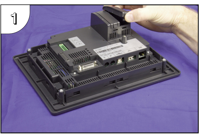
<u>Preparation:</u> Place the touch panel face down on a lint-free soft surface to prevent scratching the display screen if not already installed in a control cabinet. Again, make sure the input power is disconnected. Remove the right hand side protective slot cover, if it is installed, by squeezing the pinch tabs and lifting the cover off.

NOTE: REFER TO DATA SHEET P/N EA-EXP-OPT-DS FOR EXPANSION ASSEMBLY INSTALLATION INSTRUCTIONS. PLEASE NOTE THAT THE EXPANSION ASSEMBLY IS SHIPPED WITH JUST A LEFT-HAND PROTECTIVE SLOT COVER.