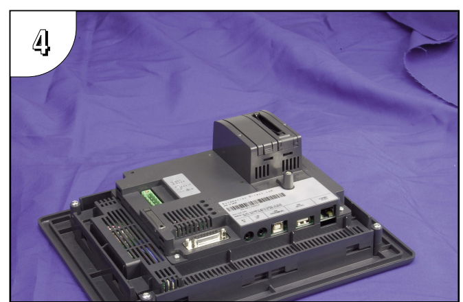
The above photo shows the CF Card Interface Module fully installed. To remove the Interface Module in the future, pry out on the top and bottom locking tabs at the same time and the module will release from the connector. Lift the module from the slot. The Interface Module should only be removed from the slot with input power disconnected.