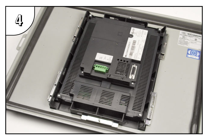
The above photo shows all mounting clips in place and the touch panel secured. The 8", 10" and 12" touch panels require 6 mounting clips and the 15" touch panel requires 8 mounting clips.