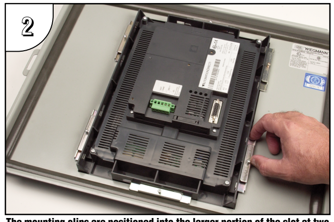
The mounting clips are positioned into the larger portion of the slot at two locations, and then slid torward the smaller protion of the slots to lock them in place. Some slots are arranged to slide to the left and others to the right.