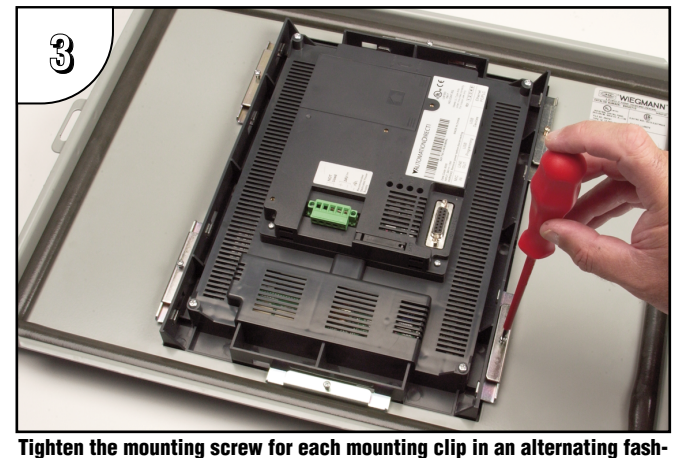
ion at all clips while observing the front of the touch panel. The goal is to make sure the front bezel is pulled up against the enclosure sheet metal uniformly, and the touch panel gasket is fully compressed all the way around its perimeter. Tighten the screws to a torque rating shown in the table below. Avoid over-tightening the screws to the point that they start to deform or bend the mounting clip.