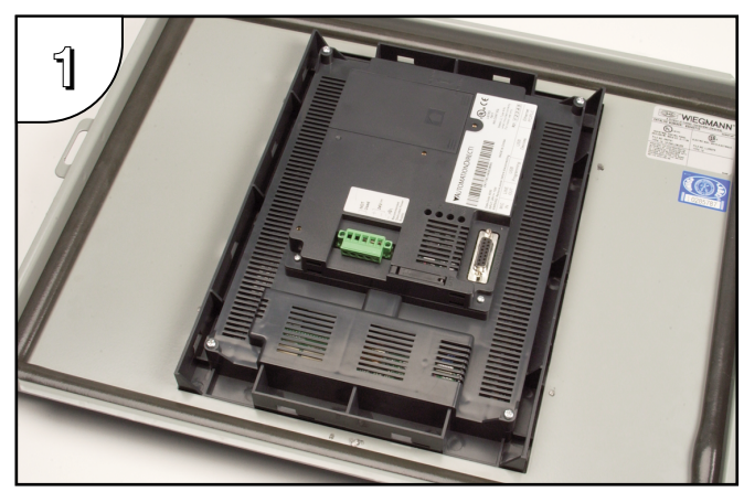
Position the touch panel through the cutout in the control cabinet door and hold in place. The mounting clips are postioned into the slots around the outside edge of the touch panel rear.