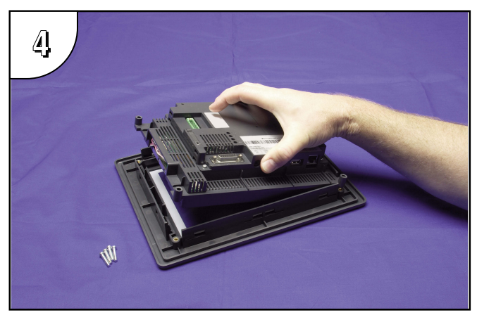
Position the touch panel's main electronics housing into the new bezel so that the flat ribbon cable on the housing matches up with the recess in the front bezel. Insert the four screws and tighten to a maximum of 70 oz-in [0.5 Nm].