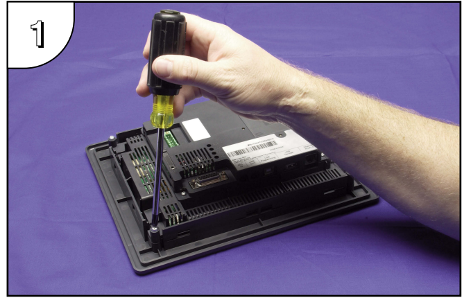
With power disconnected, use a #2 Phillips screwdriver to remove the four outer screws holding the touch panel's main electronics housing to the front bezel.

<u>Preparation:</u> Disconnect input power and all other connections, then remove the touch panel from the control cabinet. In a clean environment, place the panel face down on a lint-free soft surface to prevent scratching the front of the panel.