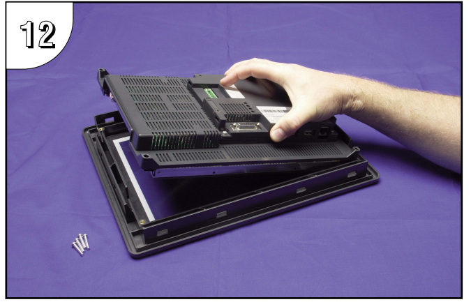
Position the touch panel's main electronics housing into the front bezel so that the flat ribbon cable on the housing aligns with the recess in the front bezel. Insert the four screws and tighten to a maximum of 70 oz-in [0.5 Nm].