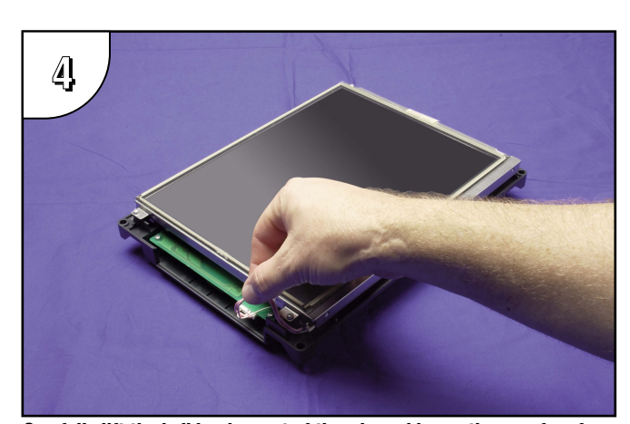
Carefully lift the bulb's wires out of the wire guides so they are free from obstructions.