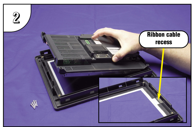
Lift the touch panel's main electronics housing from the front bezel. Set the front bezel and four screws to the side. Observe the ribbon cable recess on the front bezel (see detail) for use in re-assembling the panel.