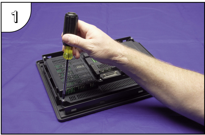
With power disconnected, use a #2 Phillips screwdriver to remove the four outer screws holding the touch panel's main electronics housing to the front here!

<u>Preparation:</u> Disconnect input power and all other connections, then remove the touch panel from the control cabinet. In a clean environment, place the panel face down on a lint-free soft surface to prevent scratching the front of the panel.