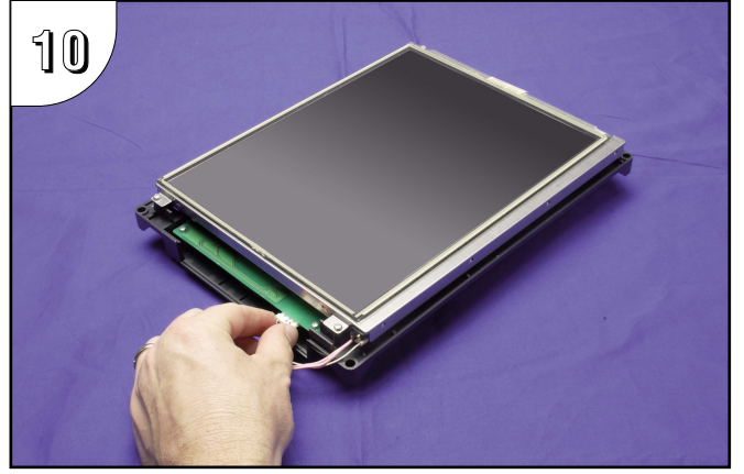
Plug the backlight bulb's power cable connector back into its circuit board connector.