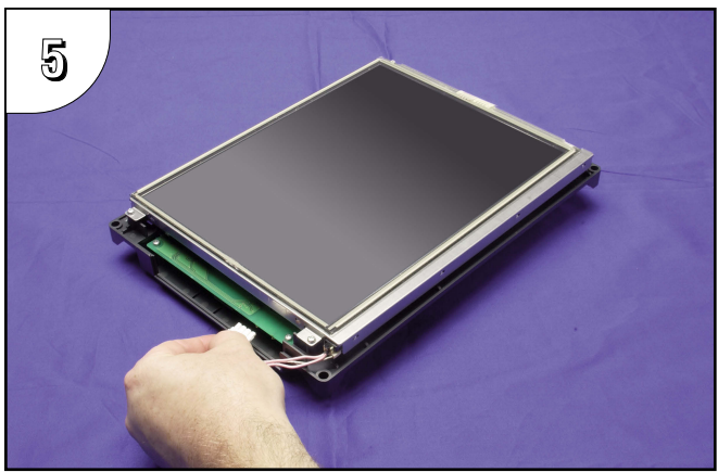
Unplug the backlight bulb's power cable connector from the circuit board connector