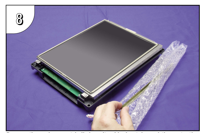
Remove the replacement bulb from its shipping tube and the protective bubble wrap.