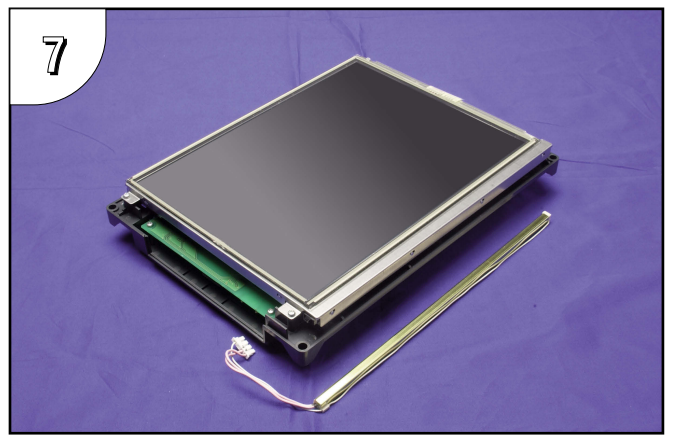
This photo shows the backlight bulb completely removed from its guide in the panel's main electronics housing.