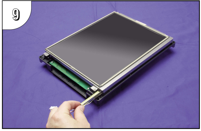
Position the replacement bulb so that the opening in its three-sided gold colored reflector faces toward the LCD touch screen. Using gentle pressure, slide the bulb into the guide until the retaining clip locks.