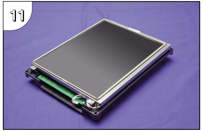
Gently position the backlight bulb's wires back into the wire guides. Position any excess wire length in between the printed circuit board and the LCD to prevent it from becoming pinched between the housing and here!