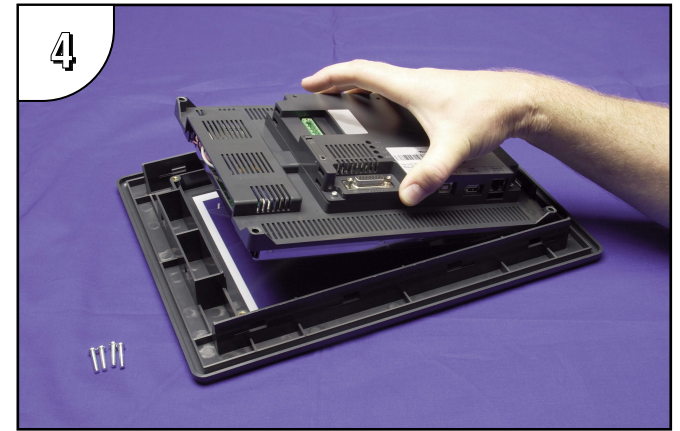
Position the touch panel's main electronics housing into the new bezel so that the flat ribbon cable on the housing matches up with the recess in the front bezel. Insert the four screws and tighten to a maximum of 70 oz-in [0.5 Nm].