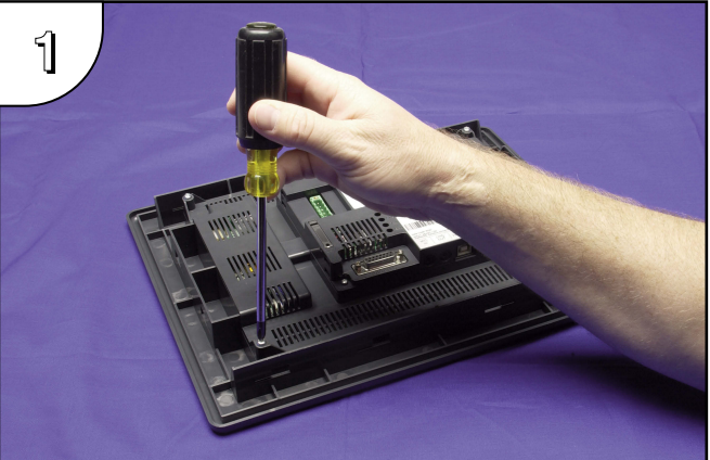
With power disconnected, use a #2 Phillips screwdriver to remove the four outer screws holding the touch panel's main electronics housing to the front bezel.

<u>Preparation:</u> Disconnect input power and all other connections, then remove the touch panel from the control cabinet. In a clean environment, place the panel face down on a lint-free soft surface to prevent scratching the front of the panel.