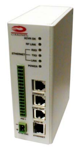
Figure 3. CR-SEHX Front Panel Diagram

Figure 3 shows the various connectors and LEDs of the CR-SEHX. Figure 4 illustrates the remote radio assembly. Connection between the CR-SEHX enclosure and the remote radio assembly is made through the 16-pin remote radio connector on the front of the CR-SEHX. Digital signals, rather than RF signals are sent over the connecting cable which may be up to 300 feet in length. These cables may be ordered from Cirronet in lengths of 100 feet to 300 feet in 100-foot increments.