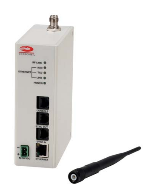
Figure 1. CR-SEH Front Panel Diagram

Figure 1 identifies the various connectors and LEDs of the CR-SEH.