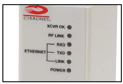
Figure 5. RF Indicators

The RF indicators include LINK and XCVR OK. On a slave CR-SEH, the RF Link LED indicates the CR-SEH has established a connection with the master CR-SEH. When a slave CR-SEH is powered on, it will take a few seconds for this LED to turn on. On a master CR-SEH the RF Link LED is on as long as any one Slave is linked. The XCVR OK LED on the CR-SEHX when on indicates the remote radio of the CR-SEHX is operating properly.