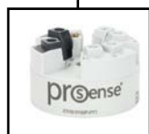
XTH2 Series Transmitter