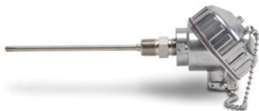
Pre-Assembled ProSense Connection Head Temperature Probe

ProSense head mounted transmitters can be easily added in the field to a ProSense connection head probe. Just order a pre-assembled ProSense connection head probe and replace the internal terminal block with an XTH2 series transmitter and included mounting hardware.