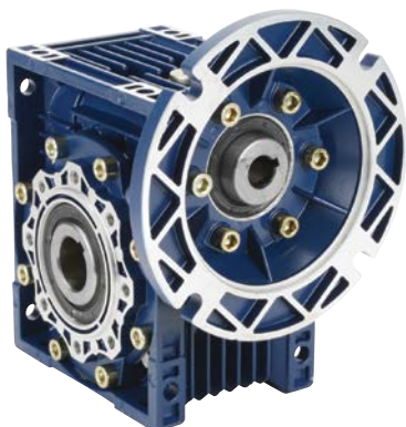
IronHorse Aluminum Hollow Bore Worm Gearbox