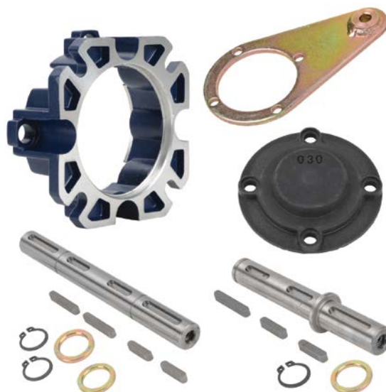
IronHorse Aluminum Worm Gearbox Accessories