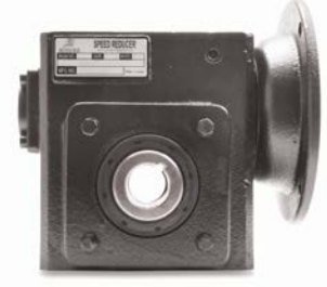
IronHorse Cast-Iron Hollow Bore Worm Gearbox