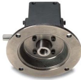
IronHorse Cast-Iron Left-Hand Shaft Worm Gearbox