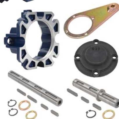
IronHorse Aluminum Worm Gearbox Accessories