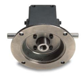
IronHorse Cast-Iron Dual Shaft Worm Gearbox