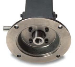
IronHorse Cast-Iron Left-Hand Shaft Worm Gearbox