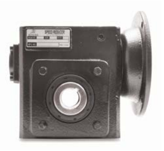
IronHorse Cast-Iron Hollow Bore Worm Gearbox