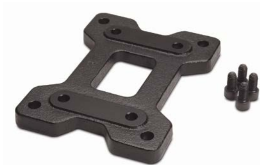
IronHorse Worm Gearbox Mounting Base