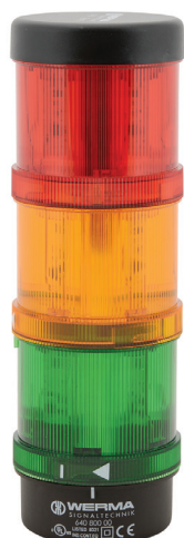
64924001 and 64924002