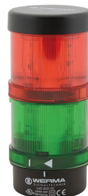
64924003 and 64924004