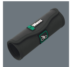
Storage and Transport