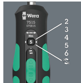
5 Selectable Torque Values