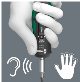
Excess Load Signal