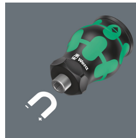
Bit Holder w/ Magnet