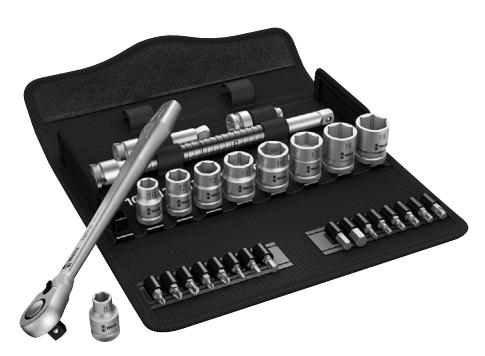
Wera socket set with Zyklop Metal switch lever ratchet, 3/8 inch drive, metric, 29 pieces. Includes the pieces listed in the table below.