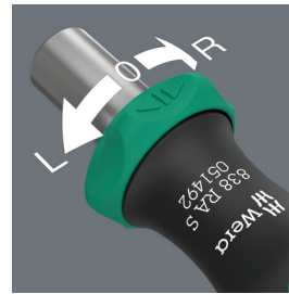
Directional Ratchet Switch