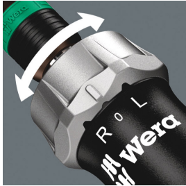
Directional Ratchet Switch