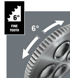
Small return angle