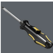
Pound through blade

A hexagonal blade extends through the handle - thereby ensuring full transfer of force, even when struck with a hammer.