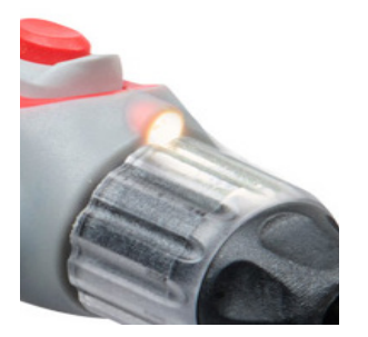
LED Work Light