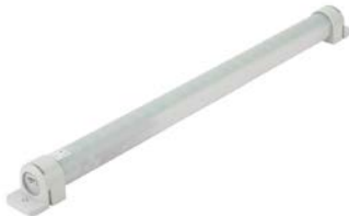
LED 022 On/off switch and magnet mount 022000-30