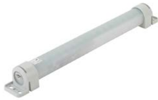
LED 021 Movement sensor and screw mount 021000-00

The Varioline is a powerful and compact LED lamp capable of fully illuminating even very large enclosures. The glare-free, 360° rotatable LED tube uses mid-power LEDs with a service life of 60,000 hours. The emitted daylight color of 6,500K provides safety for the user by a natural and non-fading color reproduction.