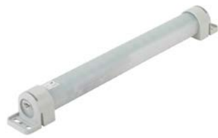
LED 021 Movement sensor and screw mount 021000-00