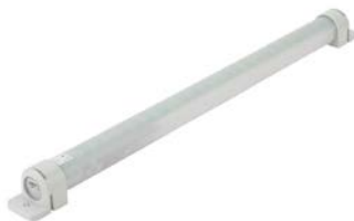
LED 022 On/off switch and magnet mount 022000-30